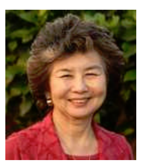
CD CLIENTS - SUPPORT GROUP FOR L.A. CHAPTER MEMBERS

If you are working consistently and on an ongoing basis (at least one year or more) with chronically disorganized clients, you are invited to participate in an informal support group.