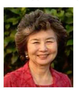
CD CLIENTS - SUPPORT GROUP FOR L.A. CHAPTER MEMBERS

If you are working consistently and on an ongoing basis (at least one year or more) with chronically disorganized clients, you are invited to participate in an informal support group.