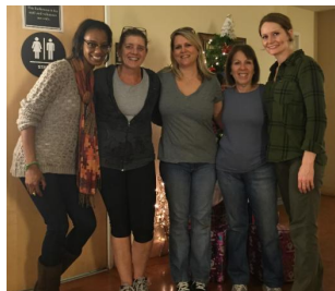
December DTWC De-Clutter Day