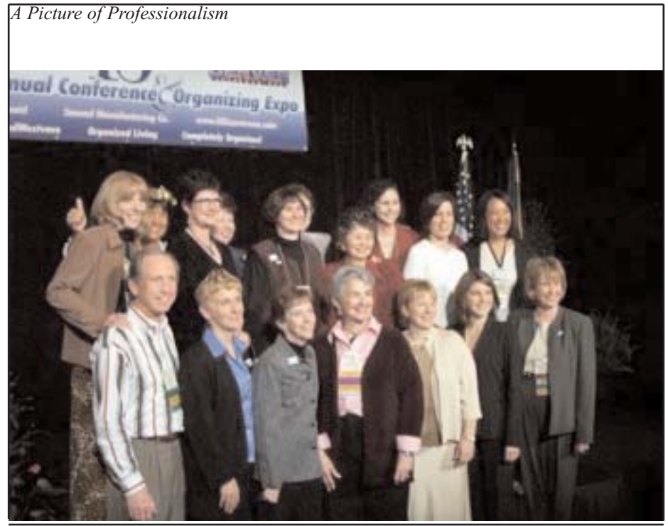
Twenty-seven happy Los Angeles Chapter members attended the NAPO National Conference and Expo in Denver last month; seventeen of them made it to the group photo session!