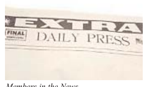
Members in the News

Please e-mail comments to this month's question to glorya@schklair.com